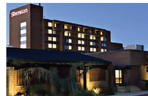
Sheraton Harrisburg Hershey Hotel